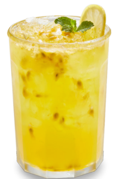
Mocktails & Cocktails