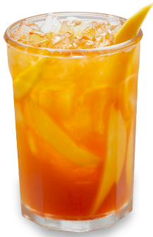
Infused Iced Teas