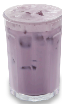
Milk Teas & Lattes