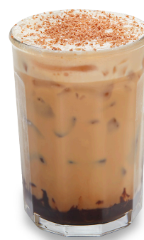
Iced Coffees & Lattes